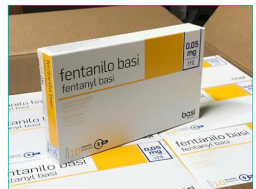
One of the medicines shipped..

AIRA Pharm GmbH and its employees are committed to affordable and accessible pharmaceutical care. We work hard every day to prevent drug shortages - especially in structurally weaker countries. We thus make an effective contribution to the success of the pharmaceutical sector. In addition to high-quality products, we offer excellent service, high performance standards and extensive safety awareness. This corporate philosophy is complemented by comprehensive, up-to-date expertise - combined with continuous training of our team. AIRA Pharm has more than 10 years of experience in trading, storage and transportation of prescription drugs, medical devices and related services in the EMEA economic area.