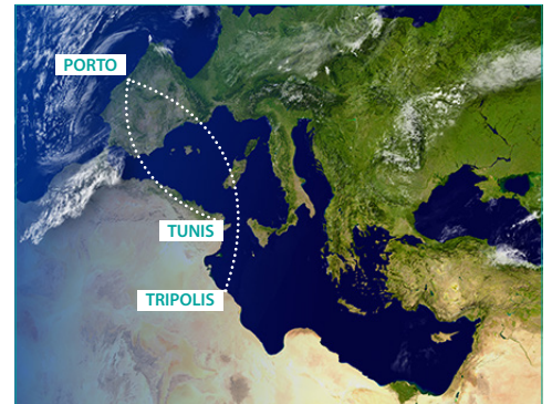
The aircraft was chartered from Tunis.