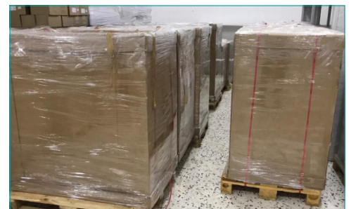
Arrival at the Libyan Ministry of Health warehouse.