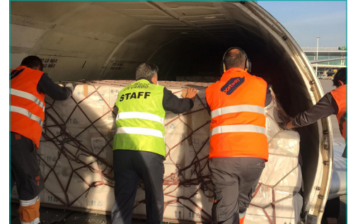
Loading of medicines at Porto airport.

We would like to thank all employees of the companies and authorities involved for this special effort!