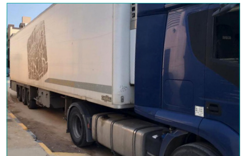
Onward transport in the cooling truck.

Laboratórios Basi has a history of more than 50 years, built on a variety of events, experiences and continuous learning.